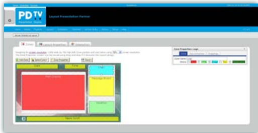
(zone layout - administrator control)