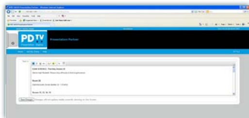
(update message zone - adhoc user control)